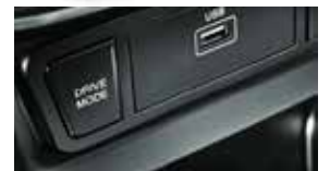
Smart driving modes